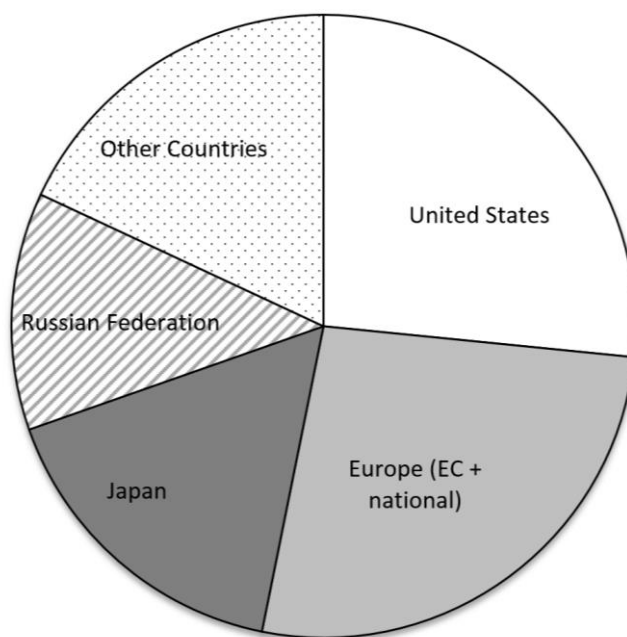
Figure 2: Direct Government Nanotechnology Spending (as share of $7.9B total in 2012)

Of course, quantifying the direct dollars spent only provides a rough measure of each country's contribution to nanotechnology innovation for at least two reasons. First, as noted above, these figures only include direct transfers from the government. The size of other government-facilitated transfers, including through the IP and R&D tax incentive systems, are more difficult to measure but no less important to innovation policy. Second, even when looking purely at direct transfers, it is critical to consider who gets the money, and under what conditions. A review of the U.S. NNI by the President's Council of Advisors on Science and Technology recommended that more money be directed to "grand challenges" with specific, measurable goals such as "the reduction in the specific energy consumption of seawater desalination to below 1.5 kWh/m 3 " or the development of solid-state refrigeration systems with energy performance that meets certain metrics. 178 Few legal scholars have turned their attention to the details of direct government R&D spending in the way that they have